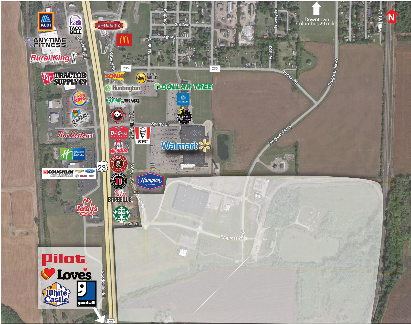
Commercial and development sites

US Hwy 23 & Circle Lane, Circleville, OH 43113