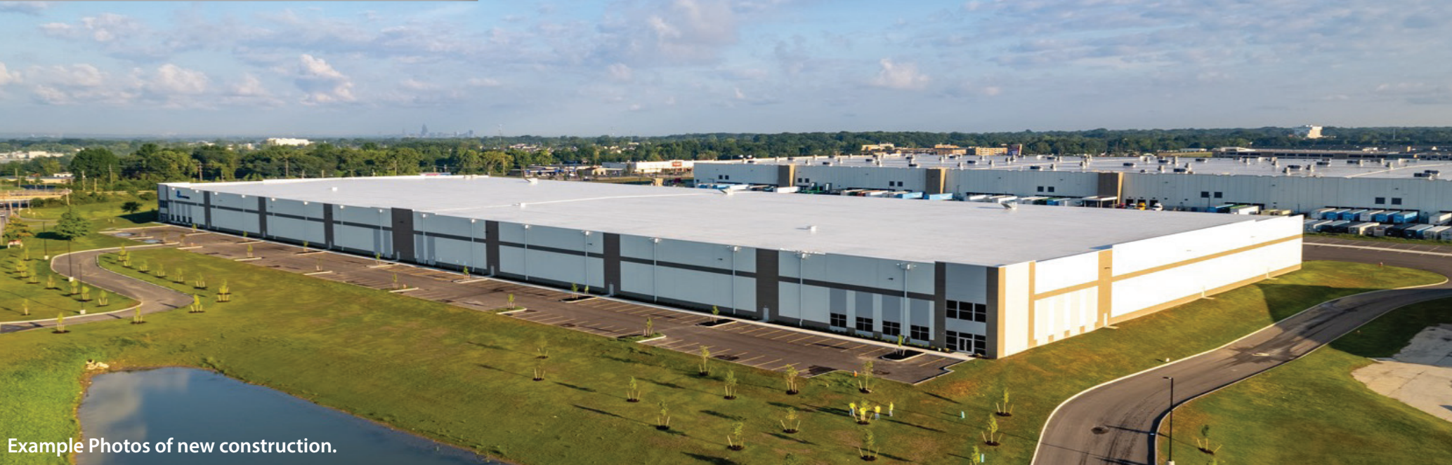
Example Photos of new construction.

INDUSTRIAL BUILD TO SUIT GILCHRIST ROAD, AKRON, OH