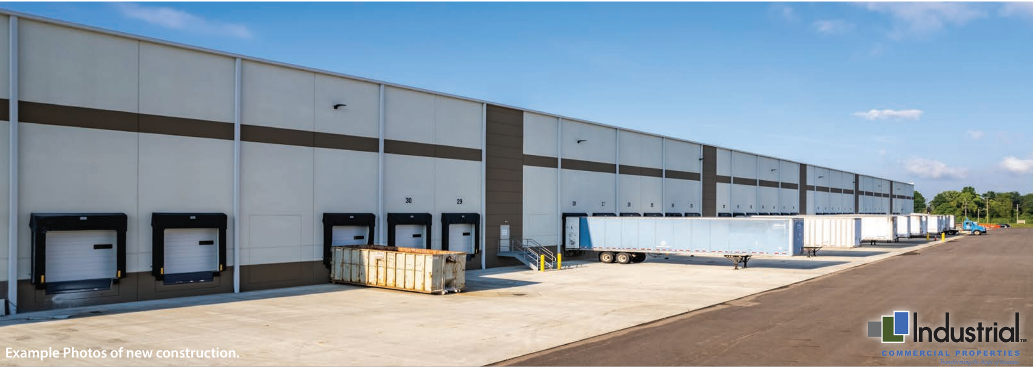
Example Photos of new construction.